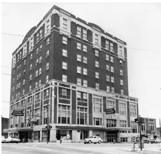
The Hickory Hotel, meeting spot for the Rotary Club of Hickory from 1926 to 1970

Today, we celebrate 96 years of the Rotary Club of Hickory as well as welcoming "sweethearts" to this special meeting.