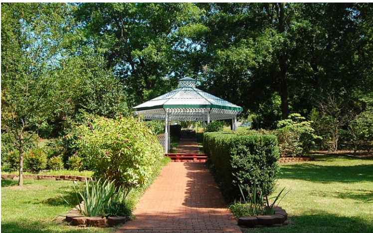
Glenn C. Hilton Memorial Park