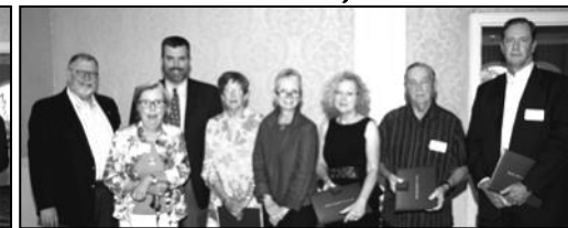
Paul Harris Fellowships awarded