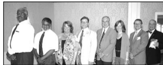
Gift recipients spoke