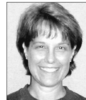
Laurie Ferguson Jenkins Elementary